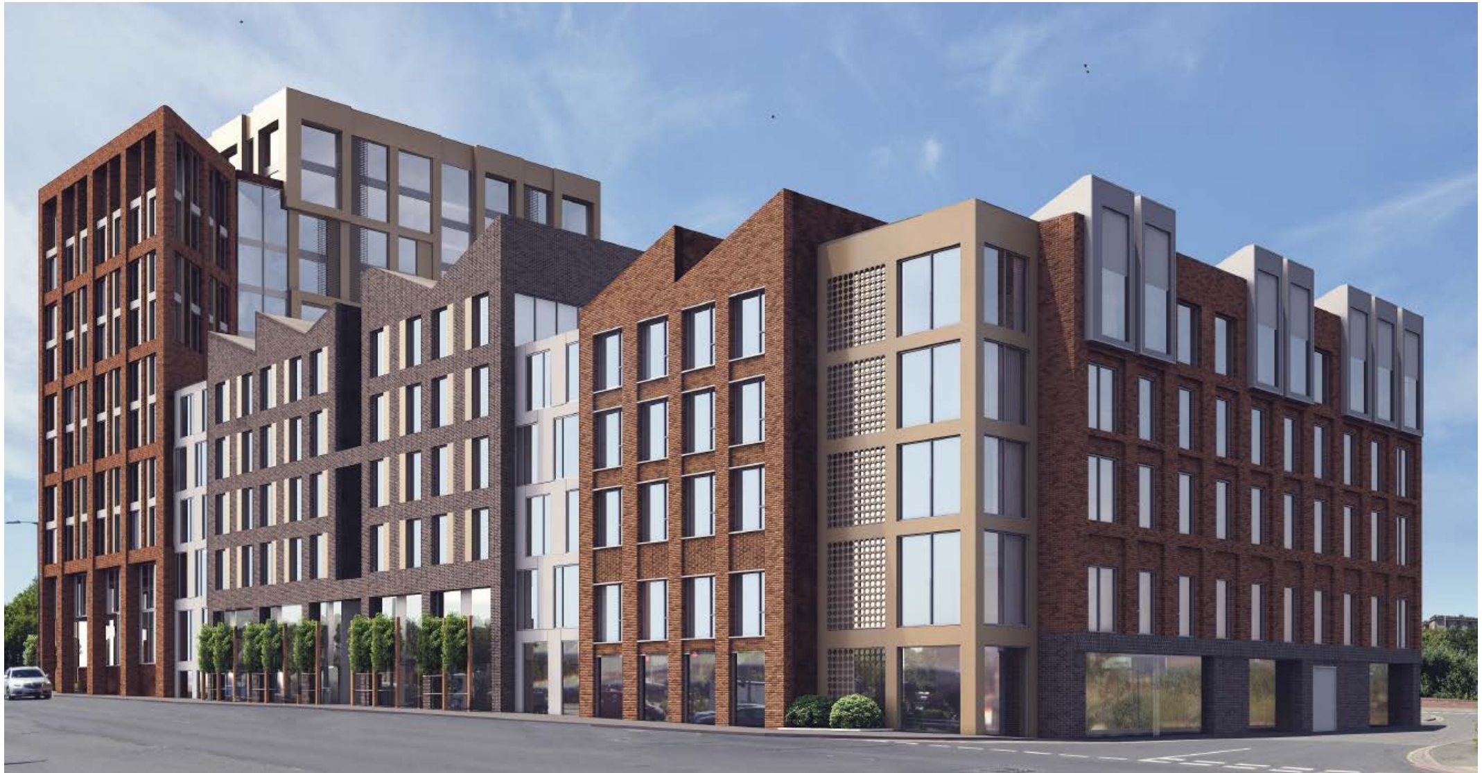
The Vantage, Traffic Street