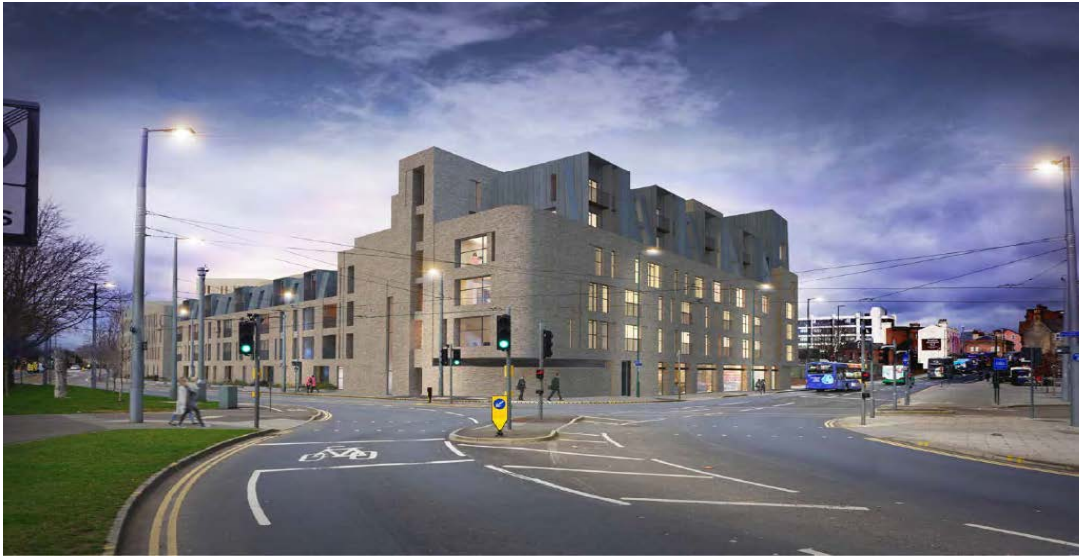
Crocus Street (Cresswell Site)